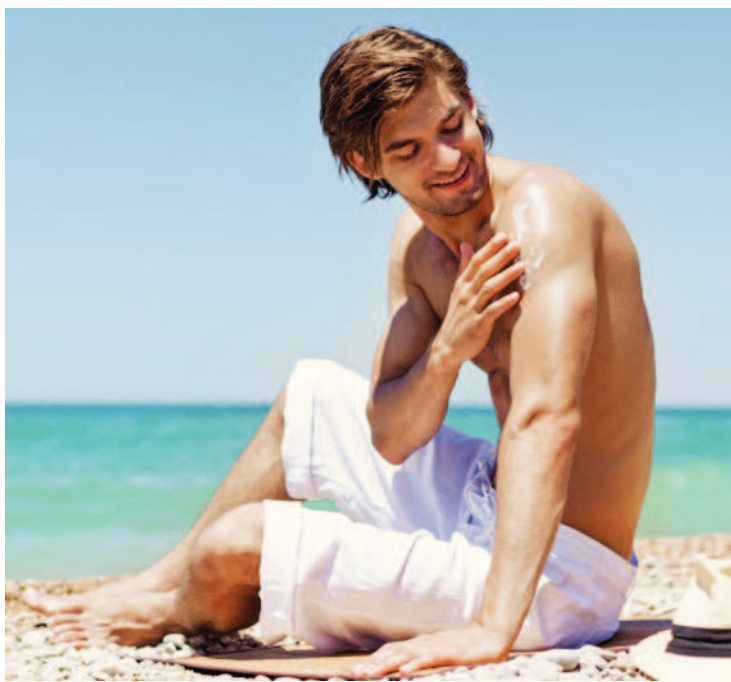
Only 14% of men, compared with 30% of women, use sun protection daily

DSM showcases solutions that changed perceptions about all-mineral sun products