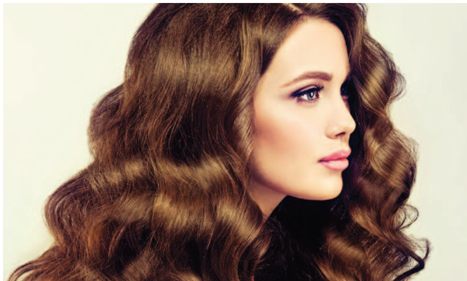
Volume is one of the top desired benefits in hair care, yet one of the most complicated to achieve without compromising care properties

while according to the recently introduced ISO 16128 standard on definitions for natural ingredients, more than 45% of our portfolio is of natural origin.