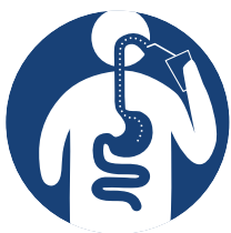
Fortified food formats

This makes us your preferred partner for unlocking new medical nutrition solutions in formats including: