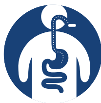
Oral nutritional supplements